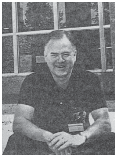
John W. Tukey