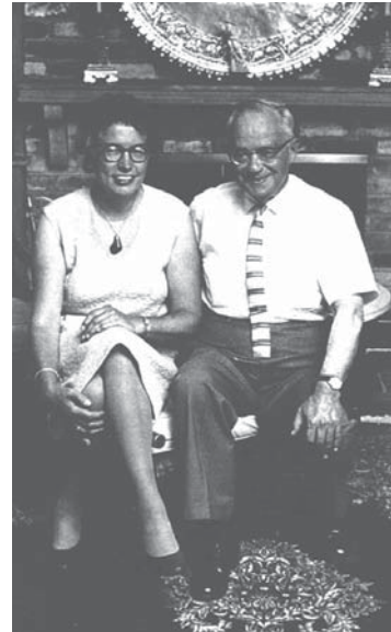
Elizabeth Scott and Jerzy Neyman