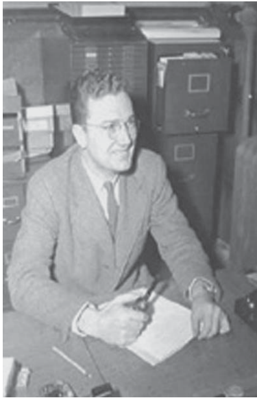
Samuel S. Wilks