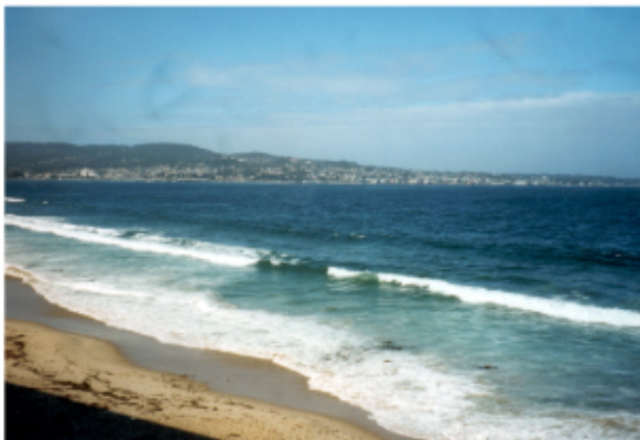
Monterey Beach Scene