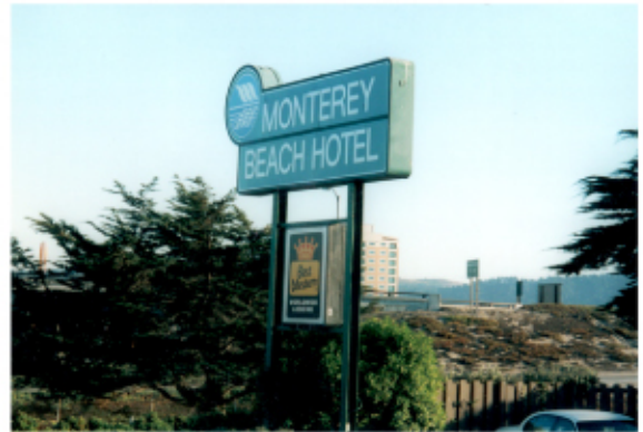
Monterey Beach Hotel Sign