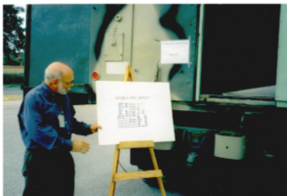
Mobile TEC After Action Review Facility