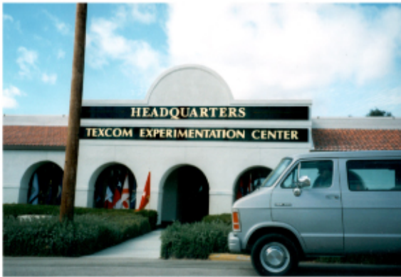
TEXCOM Experimentation Center Headquarters