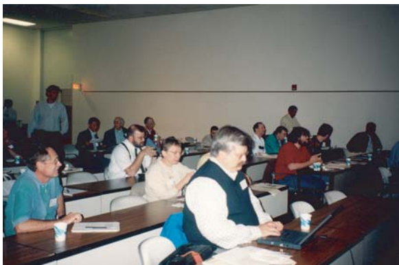
Short Course Participants